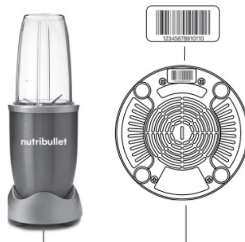
How to find serial number under the motor base.

Please visit arcaugusta.com/register-my-product.htm or register your refurbished NutriBullet. You will be asked to enter the Serial Number* of your product, along with the purchase date and place of purchase.