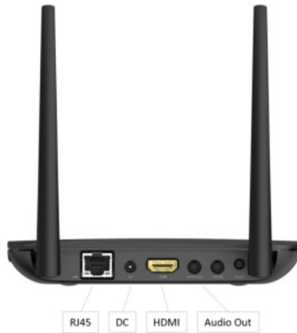
X700 Key Peripheral Ports