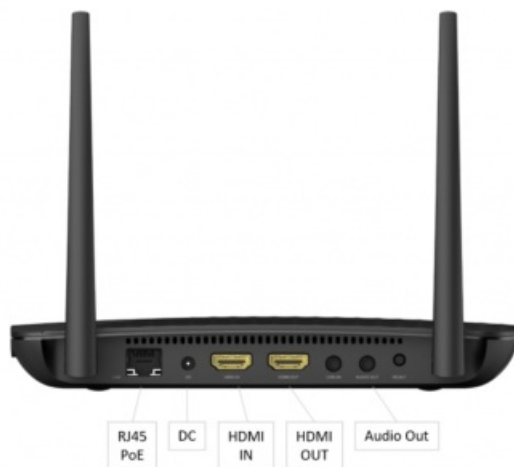
X900 Key Peripheral Ports