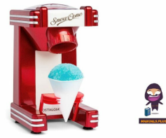
Nostalgia RSM702 Single Snow Cone Maker