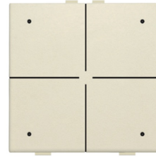
niko PD100-52204 Fourfold Push Button with LEDs and Comfort Sensors