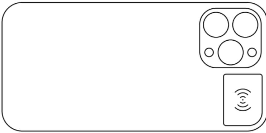
• Figure 2 Common approximate location of Android devices