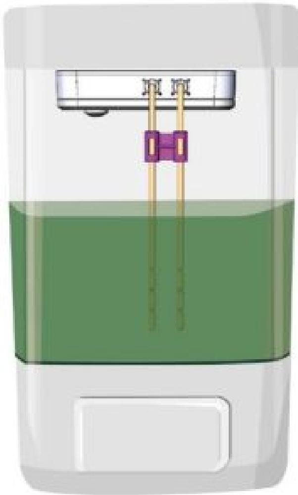
U-type Probe R720FU