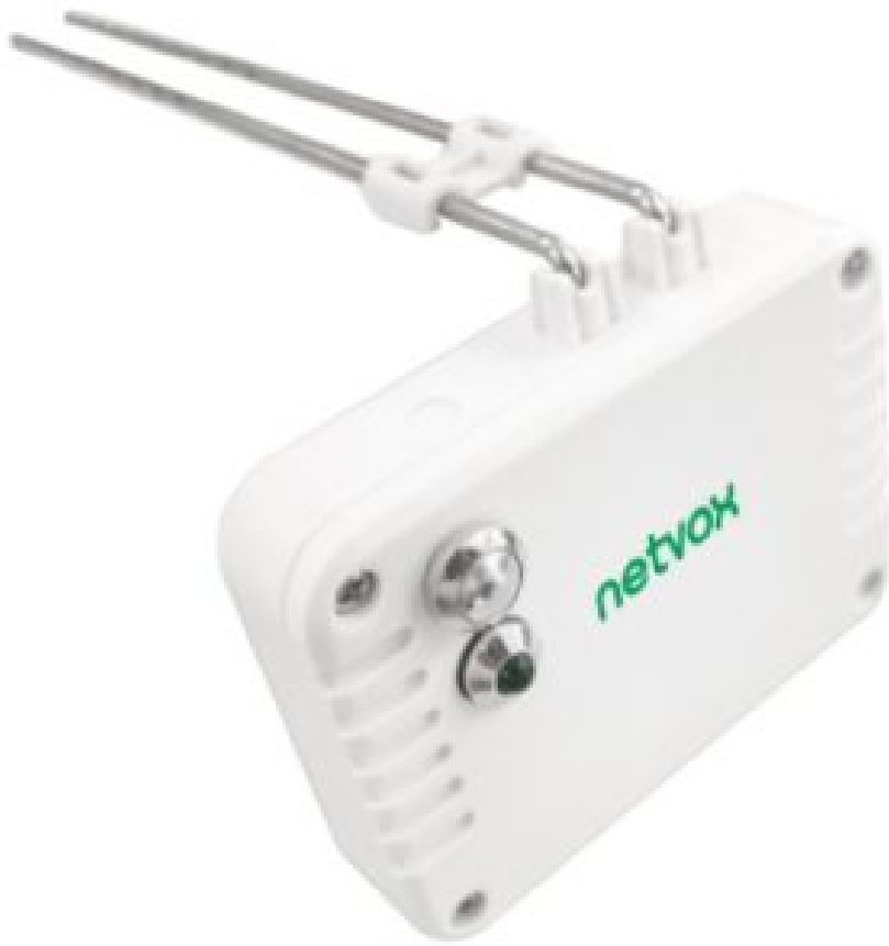
R718FU U-type Probe