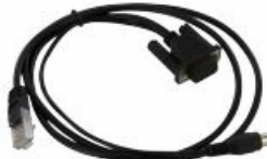
1 x Y-cable (8P8C to DE-9 and DC power input)