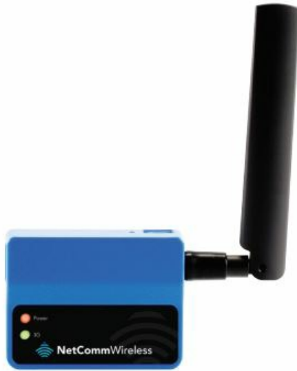
1 x NetComm Wireless NTC-3000 3G Serial Modem