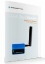
1 x Quick start guide