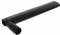
1 x Penta band 1dBi antenna with SMA connection