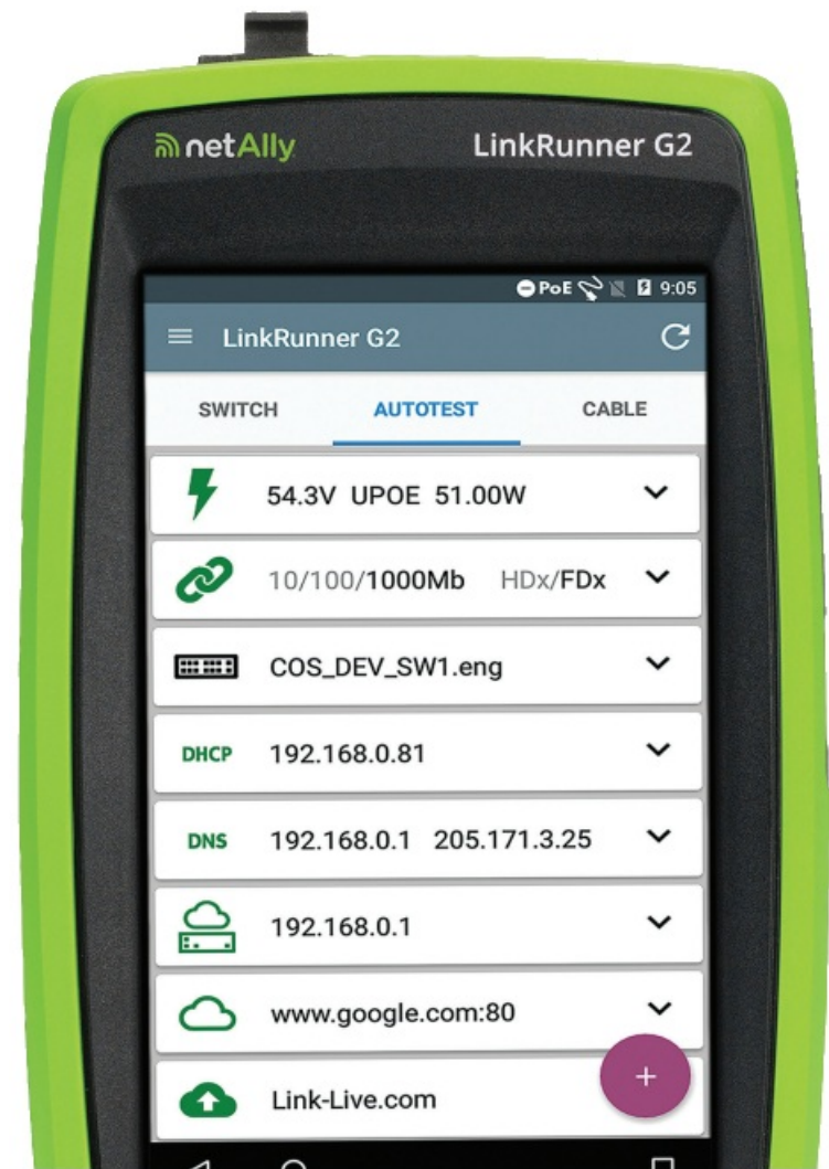
LinkRunner® G2 Enhanced Smart Network Tester