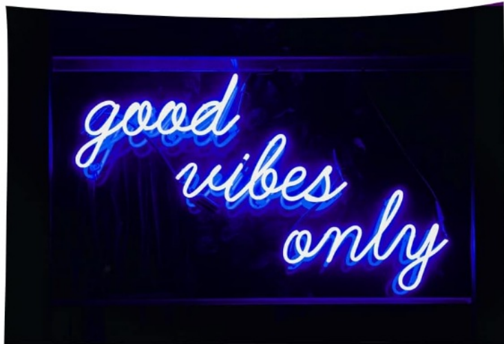
UNDER UV BLACK LIGHT