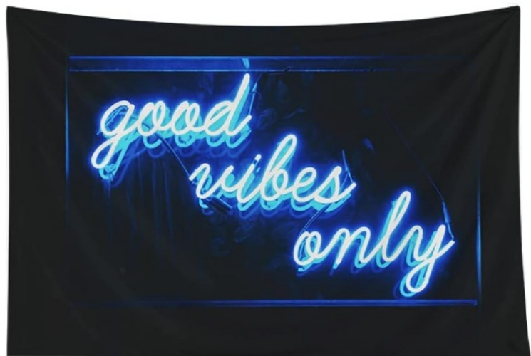
UNDER NORMAL LIGHT