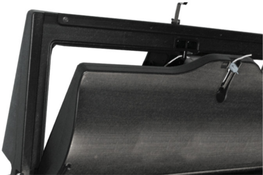
Aerodynamic frame and door design.