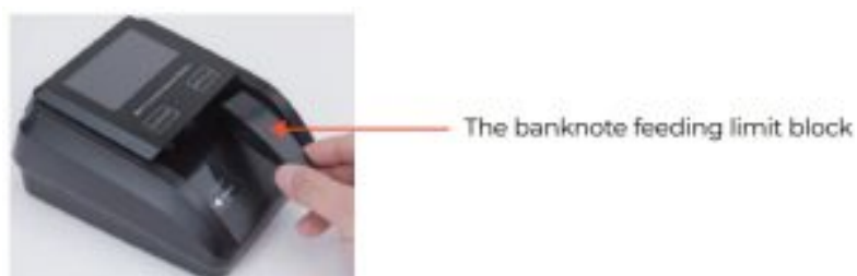
Figure 6– 4 Remove the Limit Block

As shown in the following figures, please remove the banknote feeding limit block to adjust the banknote with bigger size.