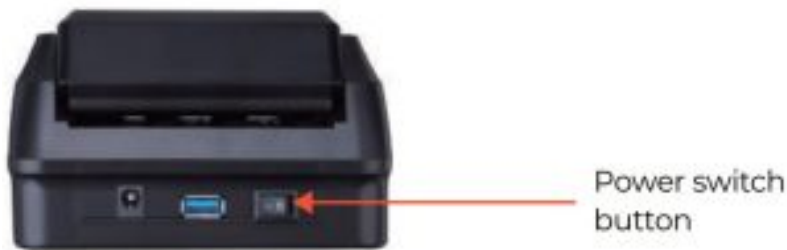
Figure 4 – 2 IMC02 Power Interface

Turn on the IMC02 by switch the power switch button to on, the screen will light up and the machine will start self-testing. If the self-test is successful, the number of banknote and the denomination will show as '0'.