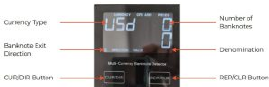
Figure 3 – 1 IMC02 Display Appearance