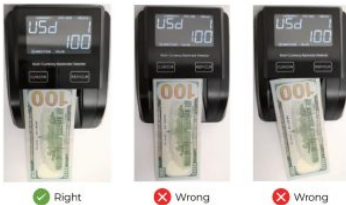
Figure 5 – 3 Banknote Insertion