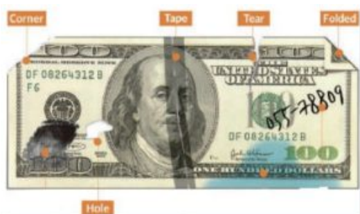
Figure 8 – 1 Bill Damaged Ways