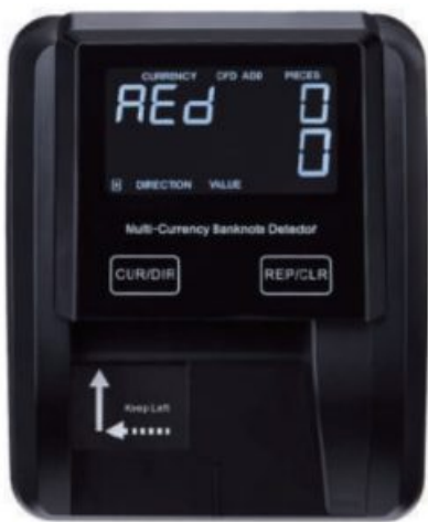
Figure 1 – 1 IMC02 Counterfeit Detector

Thank you for purchasing our products. The IMC02 is the best solution for the banknote counterfeit detection. This user manual describes the operation steps and precautions for this product. In order to improve the use and working efficiency of the product, please read this manual carefully before using, so as to operate the product accurately. Please contact us if you encounter any problem. We reserve the right to change the contents of this user manual at any time without notice.