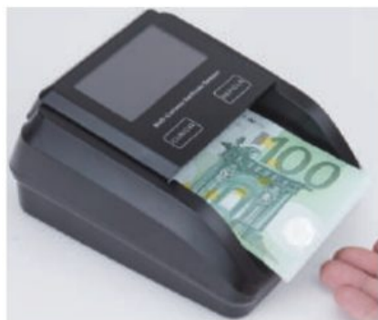
Figure 7 – 5 EUR Banknote Detecting