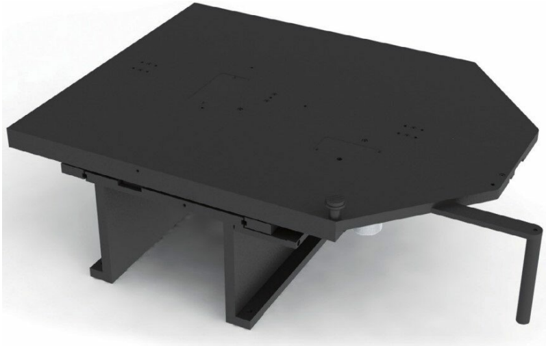
MTM-300 Cross Measuring Table Owner's Manual