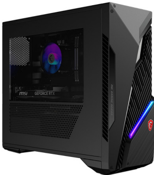
MAG Infinite S3 14th MAG INFINITE S3 14NUC5-2067TW