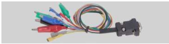
Figure 4 – Diagnostic cable for voltage regulators MS-33502