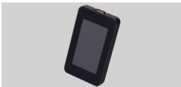
Figure 1 – General view of the tester

The tester is a portable device controlled through the touch screen (Fig. 1).