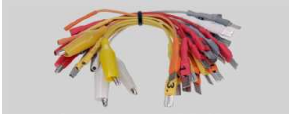
Figure 5 – Adapter cables for connection to voltage regulators