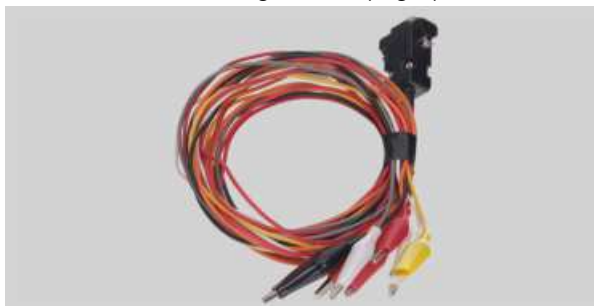
Figure 6 – Diagnostic cable for alternators MS-33501

The equipment set includes a cable for alternator diagnostics (Fig.6).