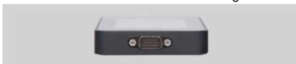
Figure 2 – Terminal for connection of diagnostic cables

In the upper part of the device, there is a terminal for connection of diagnostic cables (Fig.2).