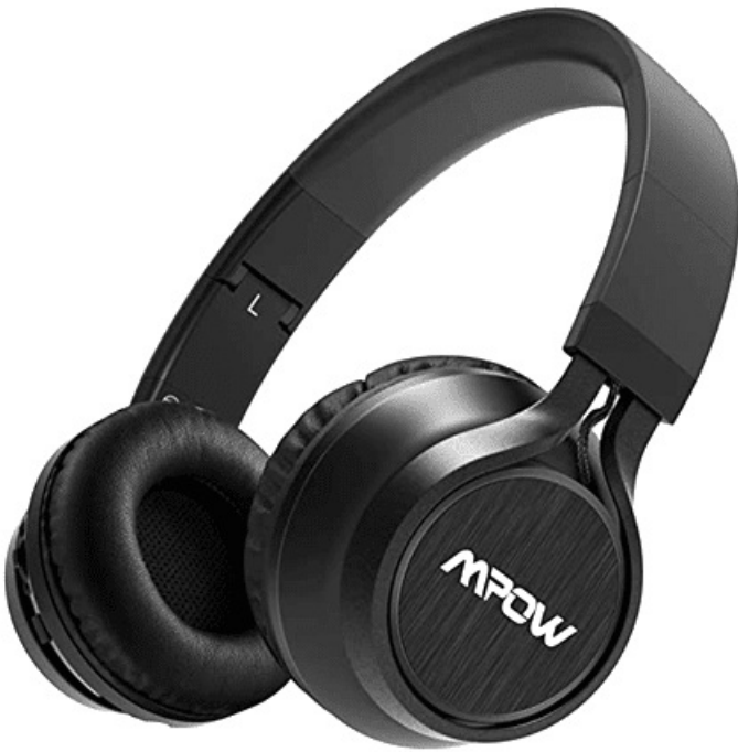
Mpow Thor Bluetooth Headset