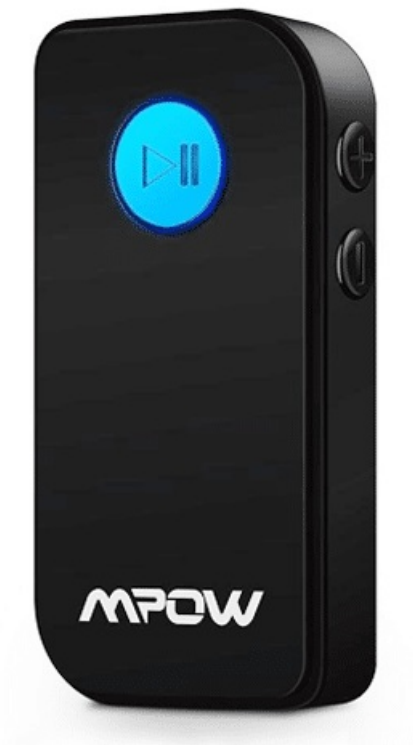
Bluetooth Music Receiver Mpow BH044D