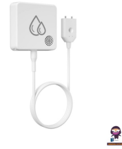
MOCREO SW2 Water Leak Detector Sensor