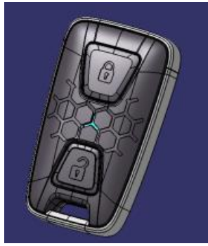
Model : MBECFOB2211