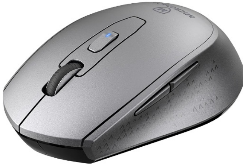
2.4GHz Wireless Bluetooth Mouse Dual Mode Instructions 225-us