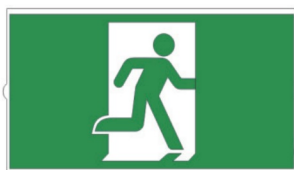
Without Arrow 1 pc