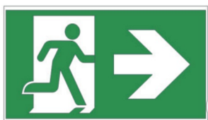
With Arrow 2 pcs