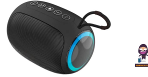
MINISO A136 Portable Wireless Speaker