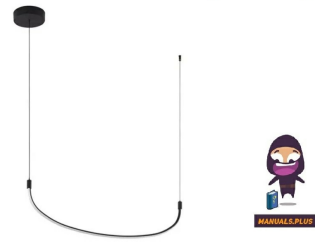
Minimalosity Skyline Modern LED Linear Ceiling Pendant Light