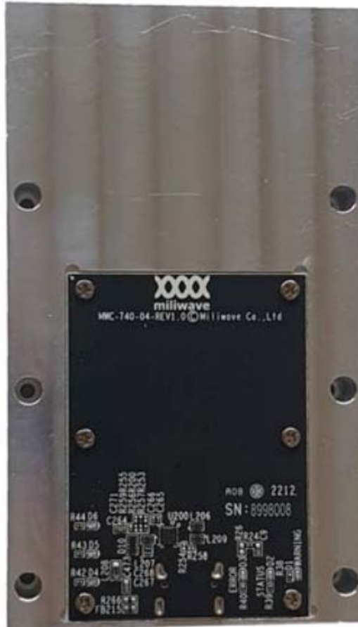
<Figure 1. MWC-740m Module>

For more information, please contact your Miliwave ( sales@miliwave.co.kr )