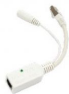
Gigabit PoE injector