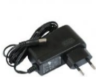
24 V 0.38 A power adapter