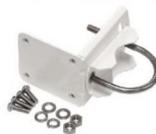
LHG precision mount