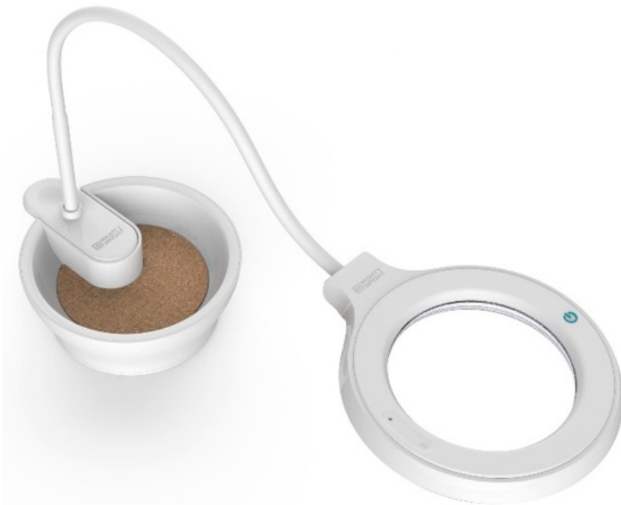
LED Task Light & Magnifier Assembly Instructions & User Guide