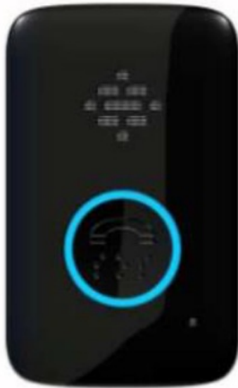
Figure 1-2 There are 2LED lights in PA30B device, the description as following.