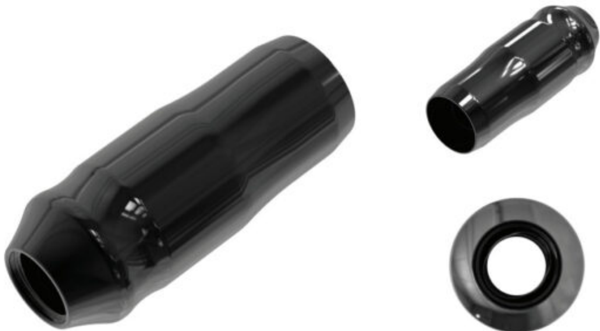
Autoclavable Ergonomic Grip design