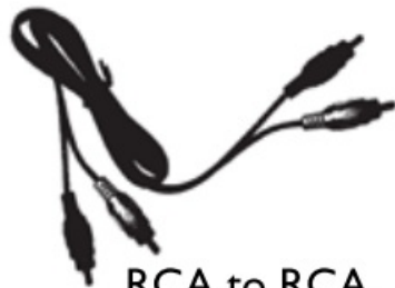
RCA to RCA