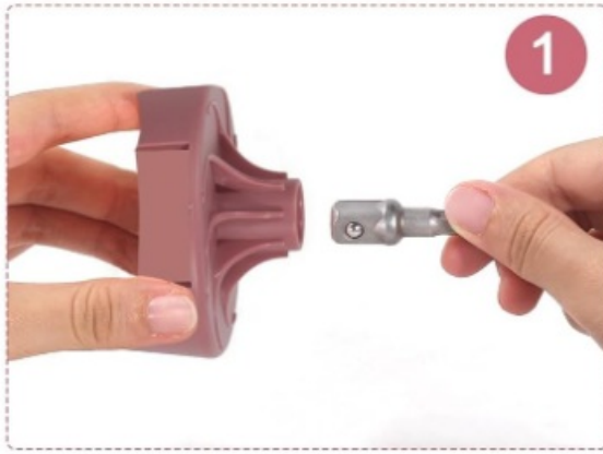
Insert the hex bit on the crank handle adapter