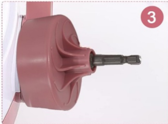
Check that it is securely installed