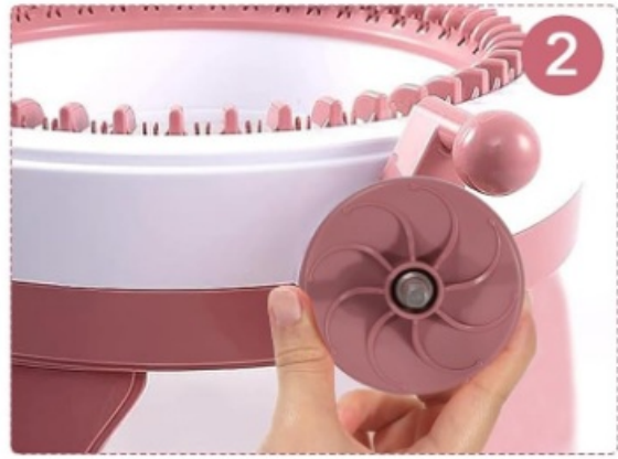
Install the adapter to the crank handle