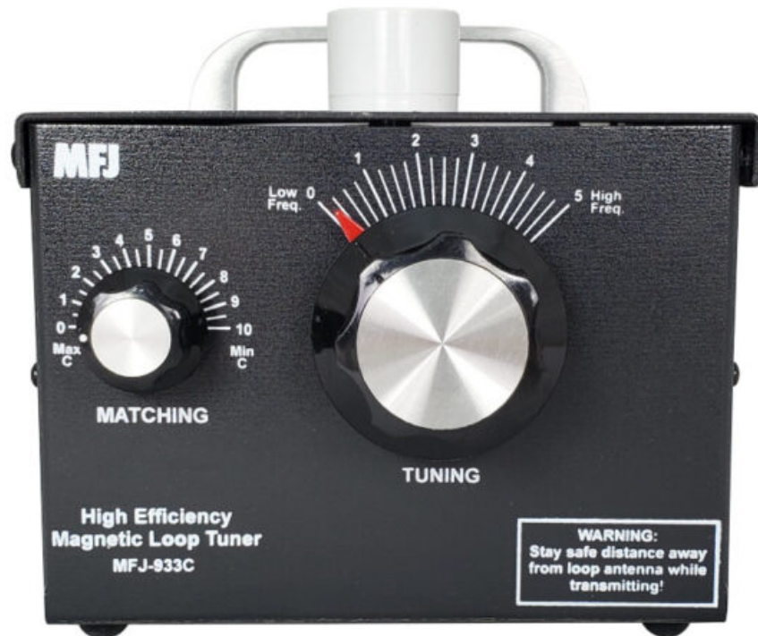
Figure 3: The MFJ-933C

The MFJ-933C Deluxe High-Eciency Magnetic Loop Tuner™ has two functions. First, it uses various lengths of wire to create a very high-Q tuned circuit that is used as a transmitting loop antenna. An MFJ-19 low-loss Butter y capacitor with no rotating contacts (available separately for your own homebrew projects) is the heart of this circuit. The second function is as a matching network that matches the high-Q transmitting loop circuit to your 50 \Omega coaxial cables.