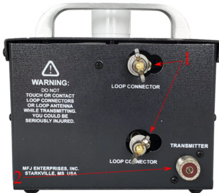
Figure 5: Rear-panel Connections: 1.) Wire loop connectors, 2.) Coax input