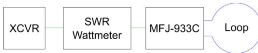
Figure 6: Typical MFJ-933C Configuration