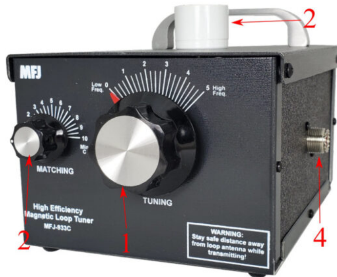
Figure 4: Front-panel Controls: 1.) Tuning Control, 2.) Matching Control, 3.) PVC Mount, 4.) Coax Output

The MFJ-933C High-Efficiency Magnetic Loop Tuner™ front panel controls and indicators (Figure4) function to permit resonating the wire loop at the output, and matching the coaxial line impedance at the input of the tuner.