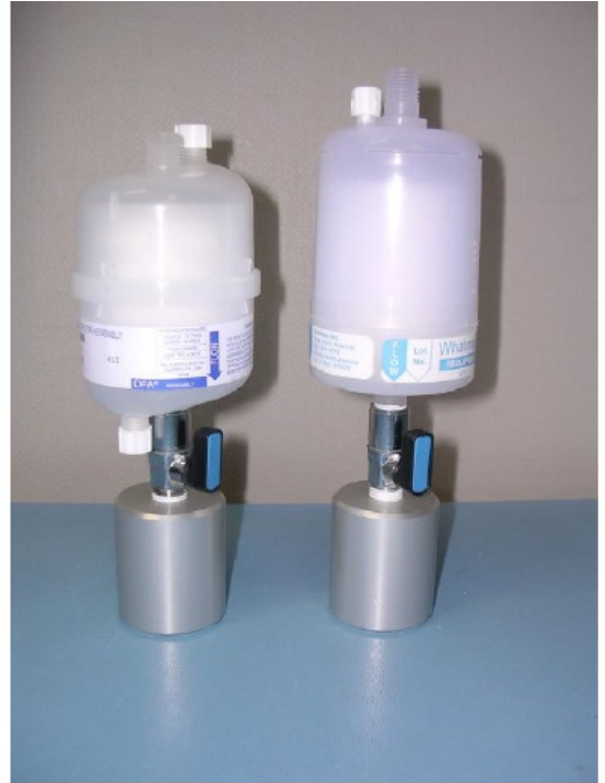
BX-302 Zero Filter Kits