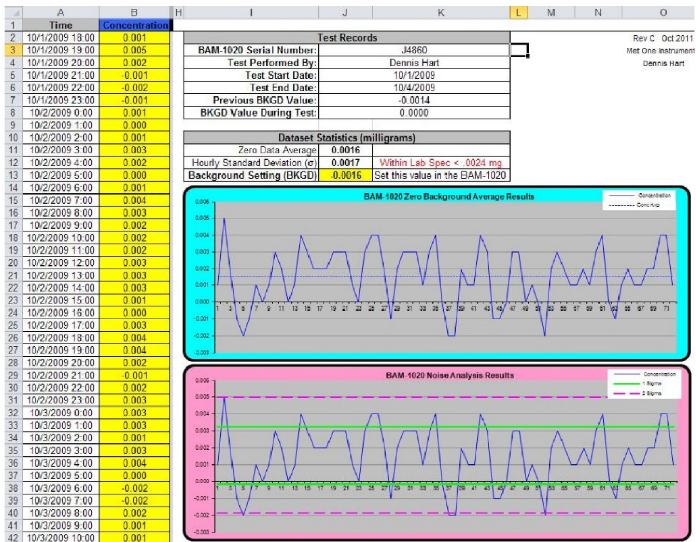
Met One Zero Data Analysis Excel Template Sample (actual test data shown)