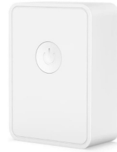
meross MSH300 Smart Wi-Fi Hub