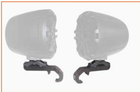
GENRRSPBRK REAR SPEAKER BRACKET (SEE PARTS LIST FOR MODELS)