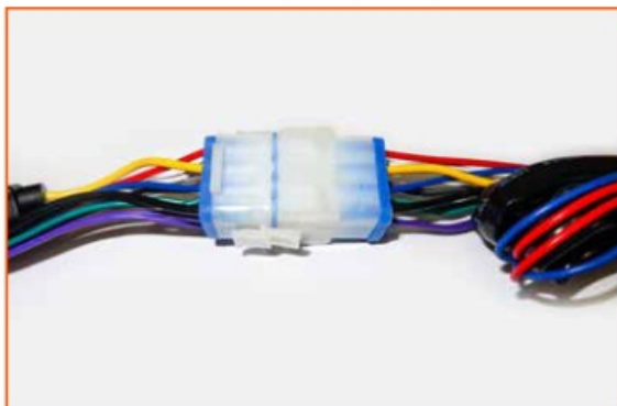
MAIN RADIO TO BLACK BOX