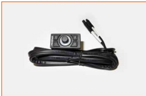
IN-DASH KNOCKOUT CONTROLLER