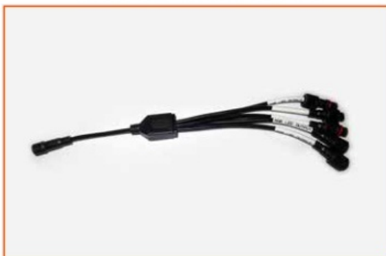
RGB 5-WAY SPLITTER TO SMC2A BLACK BOX