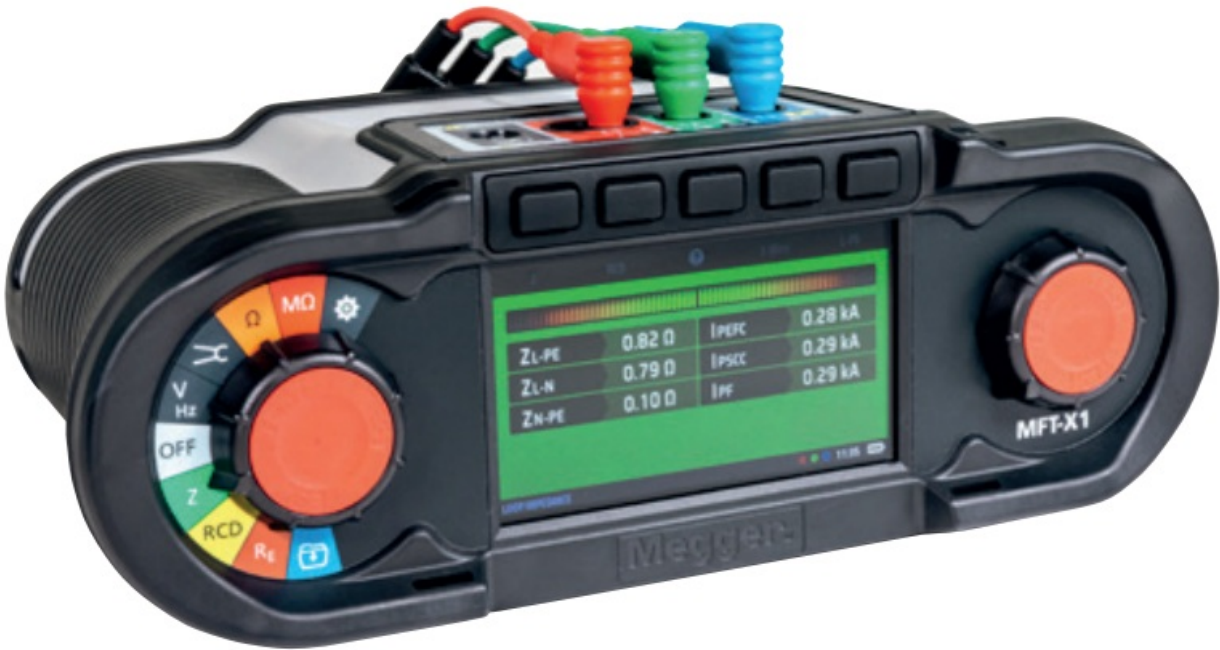
MFT-X1 Multifunction tester

MFT-X1 Multifunction Tester Owner’s Manual