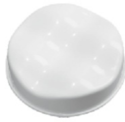
WAVY MASSAGER HEAD