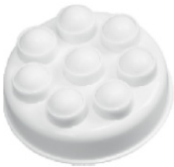
BALL MESSAGE HEAD