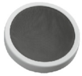
FROSTING MASSAGER HEAD