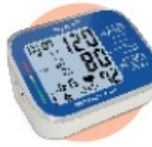
BP MONITOR - NOVACHECK BP-11 BL