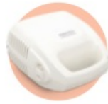
NEBULIZER - HANDYNEB SMART