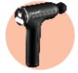
MASSAGER - GUN GMV-4