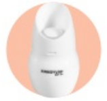
STEAM INHALER - HANDYVAP VAP-01