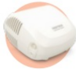
NEBULIZER - HANDYNEB CLASSIC