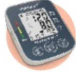
BP MONITOR - NOVACHECK BP-18