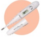
DIGITAL THERMOMETER - HANDY TMP-02