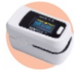
PULSE OXIMETER - OXYGARD OG-05