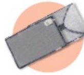
HEATING PAD - HANDYPAD HP-01