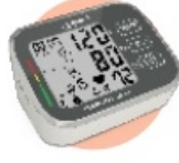
BP MONITOR - NOVACHECK BP-11