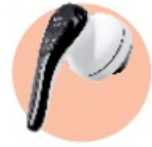
MASSAGER - GUN MPV-1