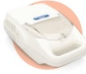
NEBULIZER - HANDYNEB PRO