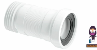
McAlpine WC-F26R Flexible WC Connectors