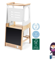
MAXI-COSI Toucan Learning Tower