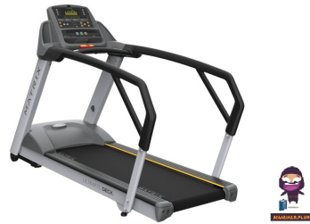
MATRIX T3xm Treadmill