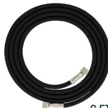
6 FT AIR HOSE