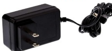
AC POWER ADAPTER