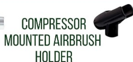
COMPRESSOR MOUNTED AIRBRUSH HOLDER