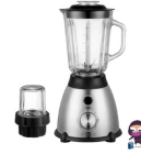
MARTA MT-KP1532B Countertop Blender