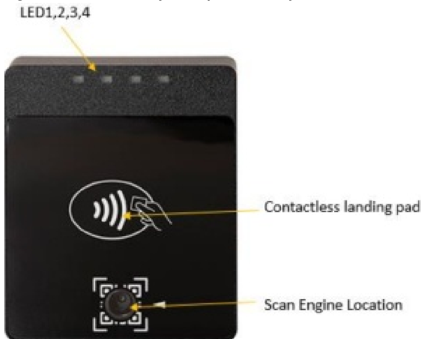
Figure 1-1 shows the major components of DynaProx with barcode reader.