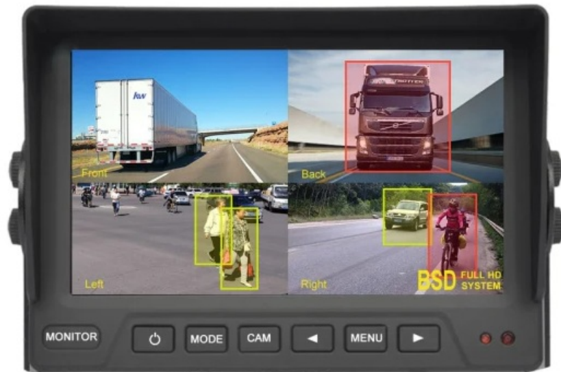
GPS NAVIGATION SYSTEM/ MONITOR WITH RECEIVER