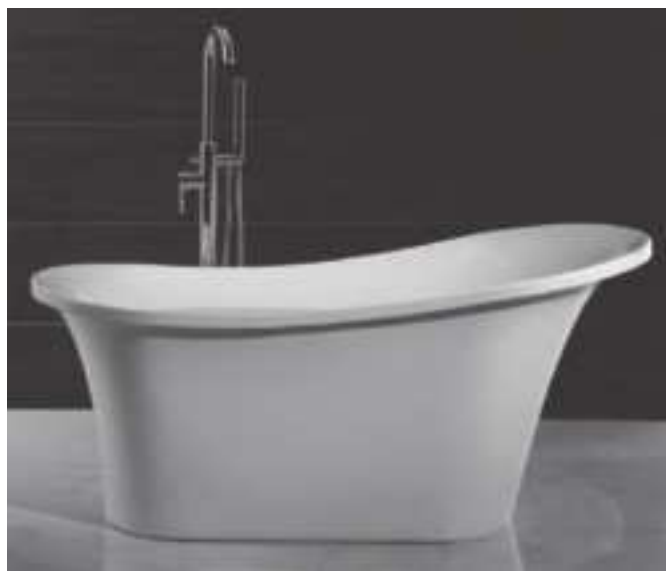
Image for installation reference only