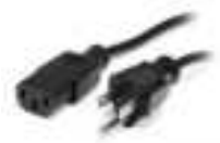
Power Cord MT03-0304-050007