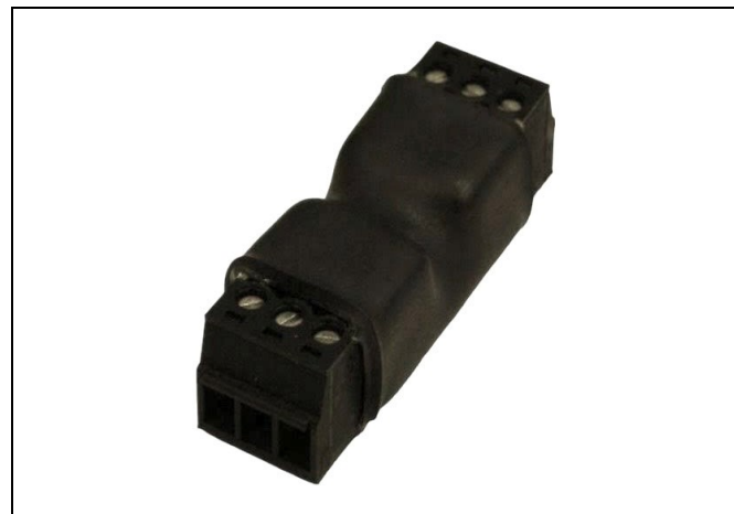
Figure 1 - Termination Block