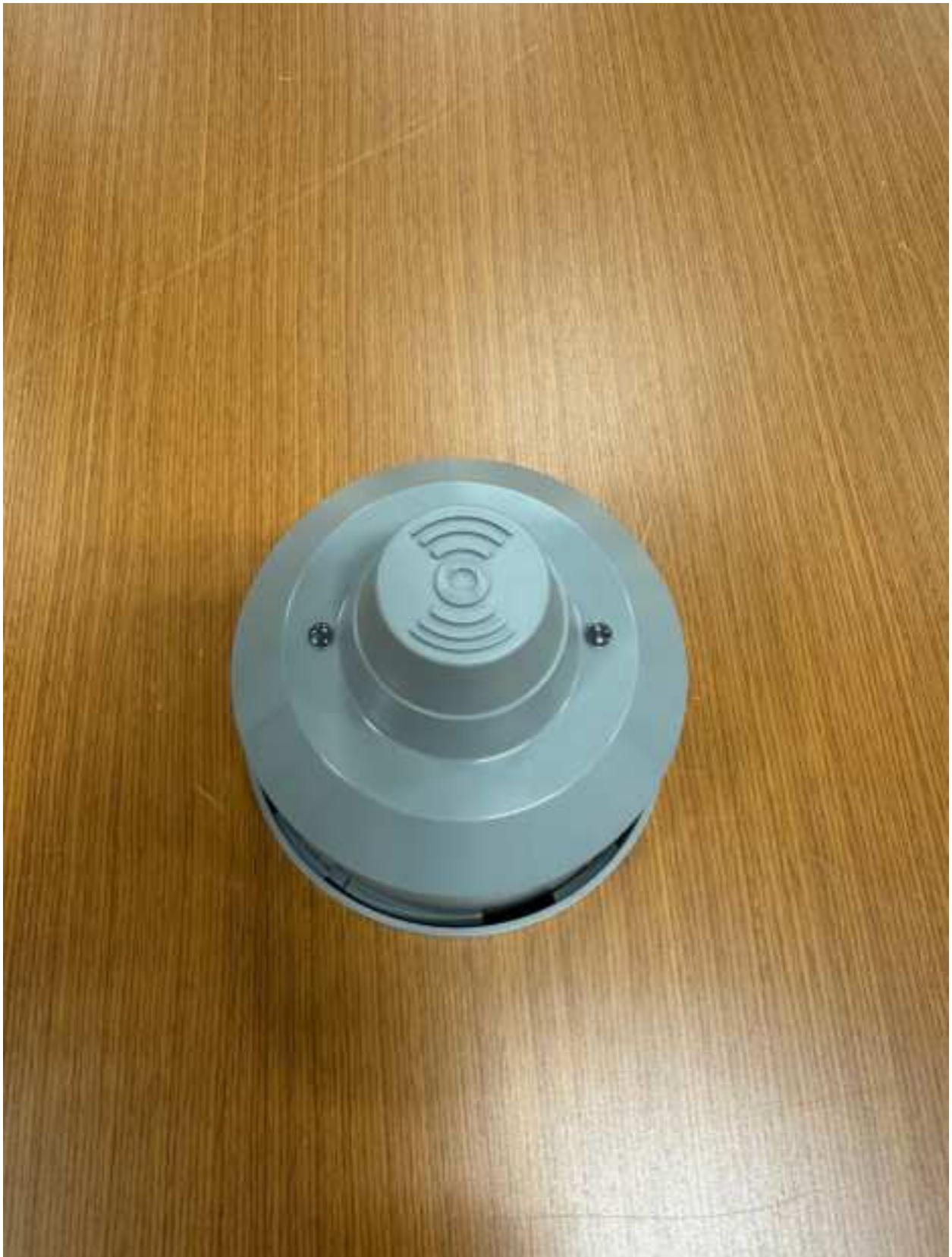
TOP VIEW of Anchor Module: