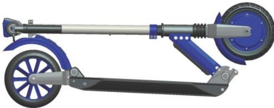
C - fully folded