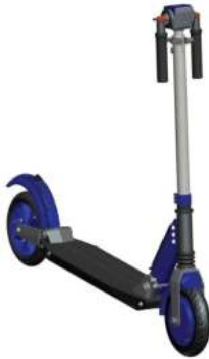
B - folding handlebars