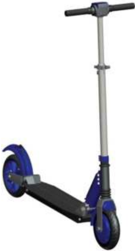
A – unfolded