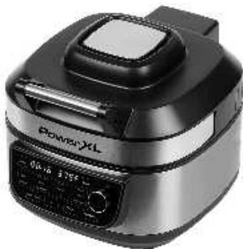
Using the Air Frying Lid