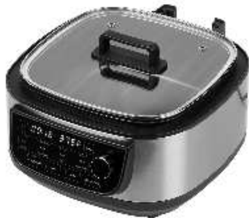
Use appliance with glass lid for Sous Vide method

When using the Sous Vide function the timer will not begin counting down until the desired temperature is reached. Reaching the desired temperature may take 30 minutes or more.