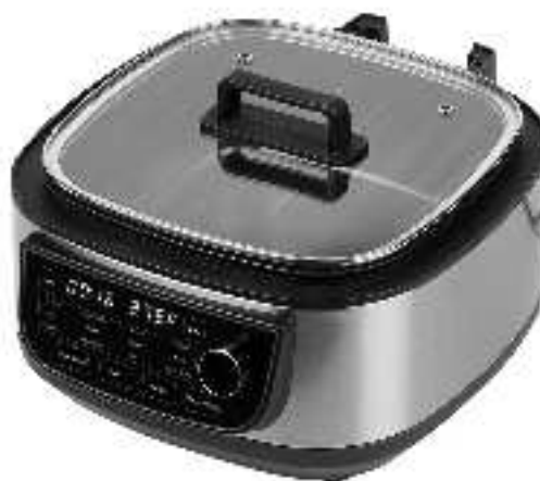
Using the Glass Lid