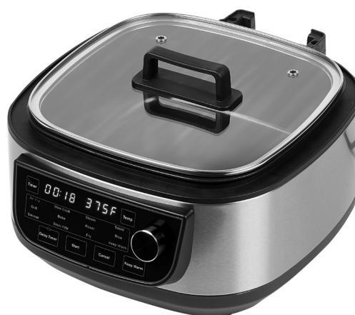
Using the Glass Lid