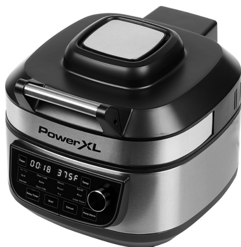
Using the Air Frying Lid